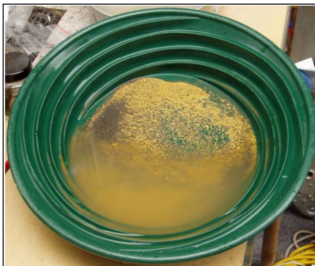
Alluvial gold grains recovered by bulk sampling Shiralee Terrace 2 Deposit 2008 ©