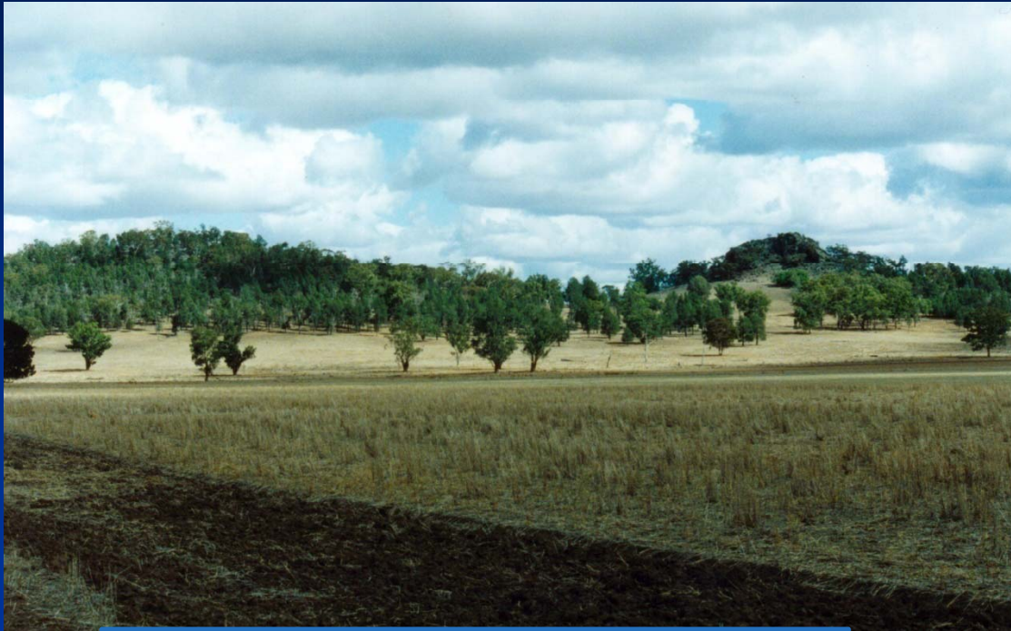
Porters Mount – view looking southwest to breccia outcrop right of picture and quartz-tourmaline altered metasediments at left.