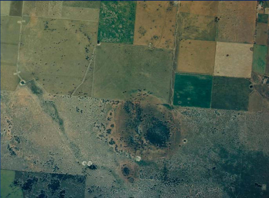
Porters Mount – aerial view