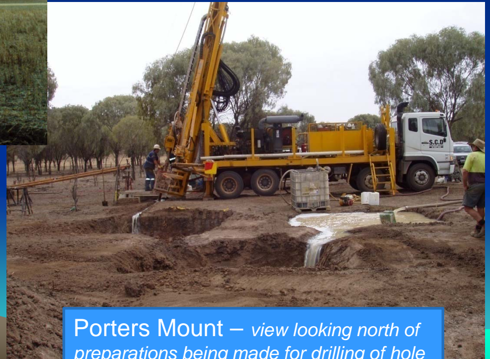
Porters Mount – view looking north of preparations being made for drilling of hole PMD001 of 890m – June 2008