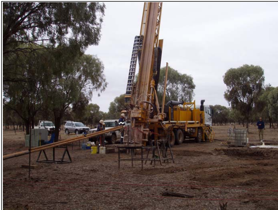
Drill rig set up on hole PMD01 – Porters Mount Prospect – June 2008 ©